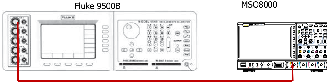
Figure 2-1 Impedance Test Connection Diagram