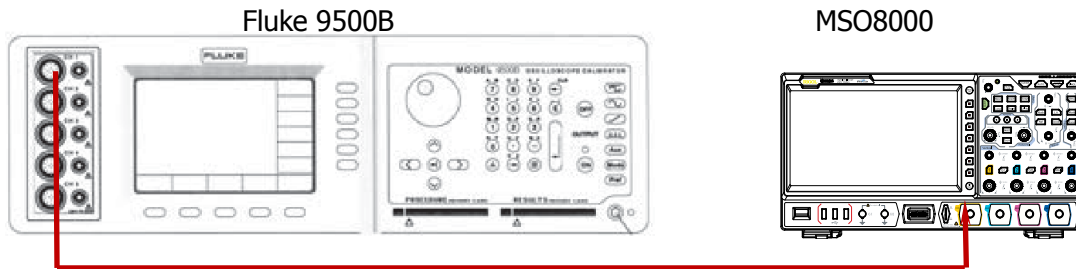
Figure 2-2 DC Gain Accuracy Test Connection Diagram