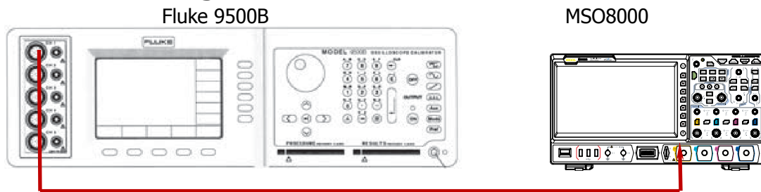
Figure 2-3 Bandwidth Test Connection Diagram