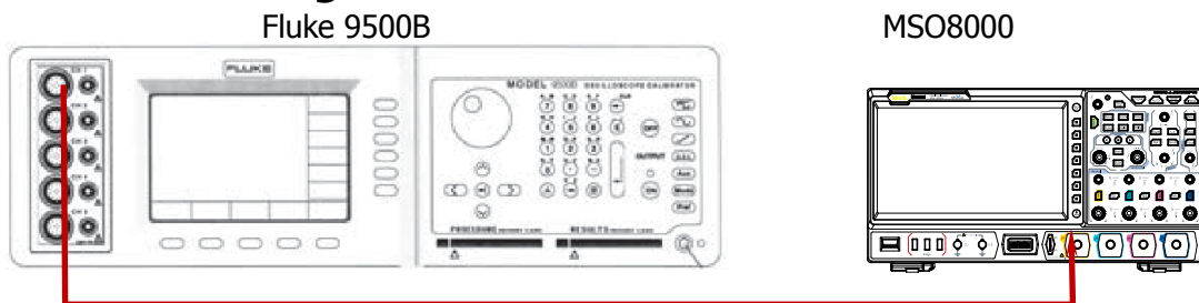
Figure 2-5 Timebase Accuracy Test Connection Diagram